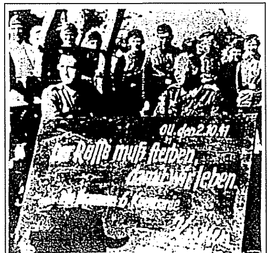
"The Russian must die so that we may live" - the battle cry of fascist German Wehrmacht in its attack on Stalin's socialist Soviet Union.

After the defeat of the Nazis in World War II, this tradition was continued. Although they had been shipwrecked, their ideology had not been lost. German imperialism was indeed defeated, but it was far from smashed; on the contrary, it came back to life. In West Germany, capital grew stronger with each passing year, and recreated an army of aggression, the Bundeswehr, in the tradition of the Wehrmacht. And once